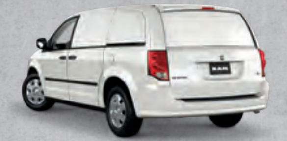
SOLID FULL-WINDOW PANEL INSERTS. The standard configuration for Ram C/V Tradesman features molded privacy inserts for both sliding doors, the rear-quarter vents, and the rear liftgate.

MODELS WITH GLASS REAR LIFTGATE INCLUDE SUNSCREEN GLASS, REAR-WINDOW DEFROSTER AND REAR WIPER.