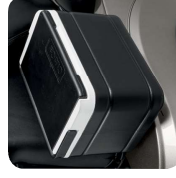
Caddy Master Cooler