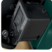
Ball and Club Cleaner