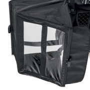
Bag Cover with Magnetic Latch