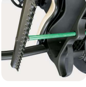
Sand Trap Rake Kit