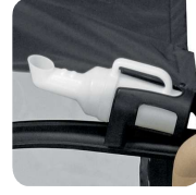
Divot Repair Sand Bottle