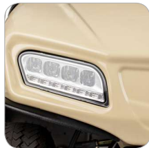
LED Headlights with Daytime Running Lamps standard

The new Villager includes safety-enhancing features such as LED headlights (with daytime running lamps), a four-wheel braking system, turn signals, tail/brake lights, and a horn to ensure that your guests arrive safely.