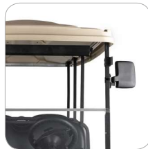
Multiple options available to enhance style and comfort