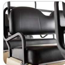
Easy-to-Clean, Durable, Marine-Grade Vinyl Seats