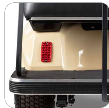
LED Tail Lights and Turn Signals standard