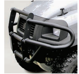
Heavy-duty Brush Guard