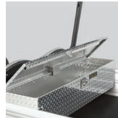
Aluminum Tool Box (Lockable)