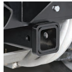
2-inch Front Receiver