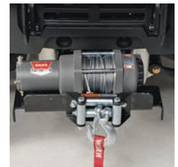
2500 lb. Winch