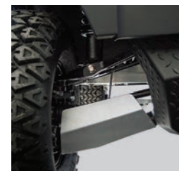
CV Boot Guards (Metal)