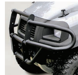
Heavy-duty Brush Guard