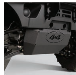
Front Skid Plate