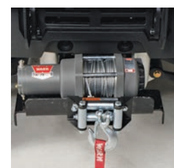
2500 lb. Winch