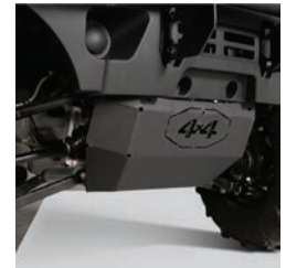
Front Skid Plate