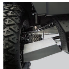
CV Boot Guards (Metal)