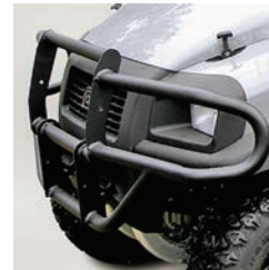
Heavy-duty Brush Guard